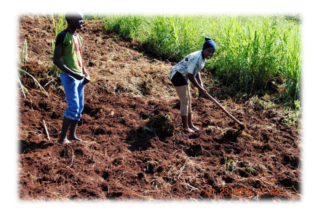
2016 Priorities and Initiatives

The <u>Zawadi Society</u> is a Kenyan organization through which local civic groups, businesses, religious bodies and individuals support the Centre's programs through volunteering, mentoring, financial or in-kind support.